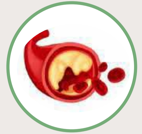
Narrowing of Artery