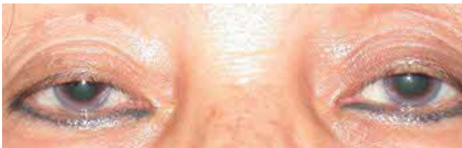
Image of a patient with droopy eyelids for both eyes (i.e. something more layman rather than using the medical terms)