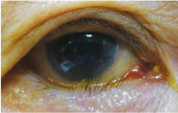
Image showing the in-turning of right lower eyelid margin (i.e. simplifying medical terminology)