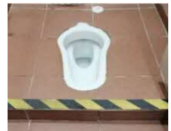
Avoid using squatting toilets if you have weak legs or unsteady gait