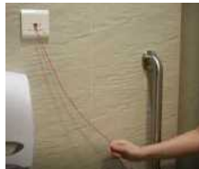
Pull the call bell for help