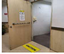
Doors that swing outwards