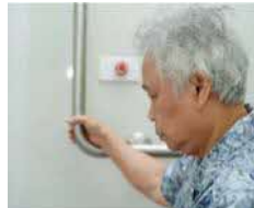
Support yourself with grab bars