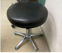
Chairs with wheels or without back support