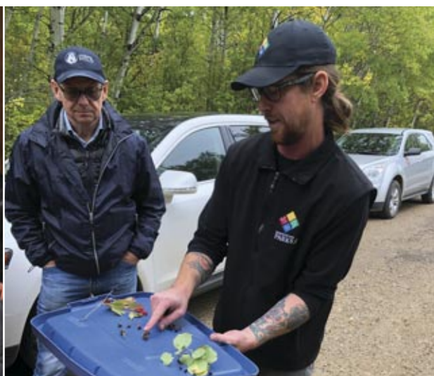
Moose Mountain Provincial Park