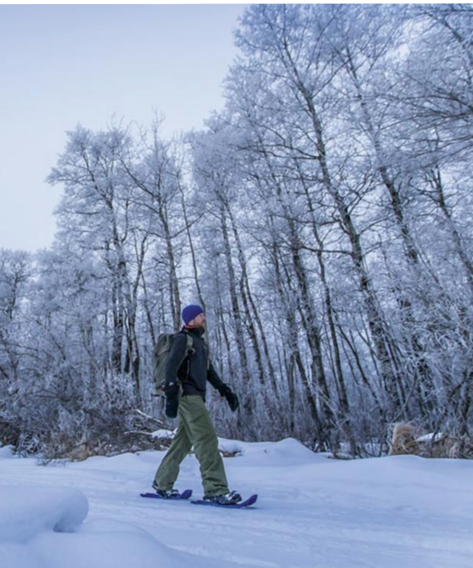
Greenwater Lake Provincial Park

In 2018, Destination Canada (DC) released a report titled Unlocking the Potential of Canada's Visitor Economy . The study examines five barriers that constrain growth of Canada's tourism sector. First on the list of challenges is the fact that demand for Canadian tourism experiences is geographically and seasonally concentrated. (p8)