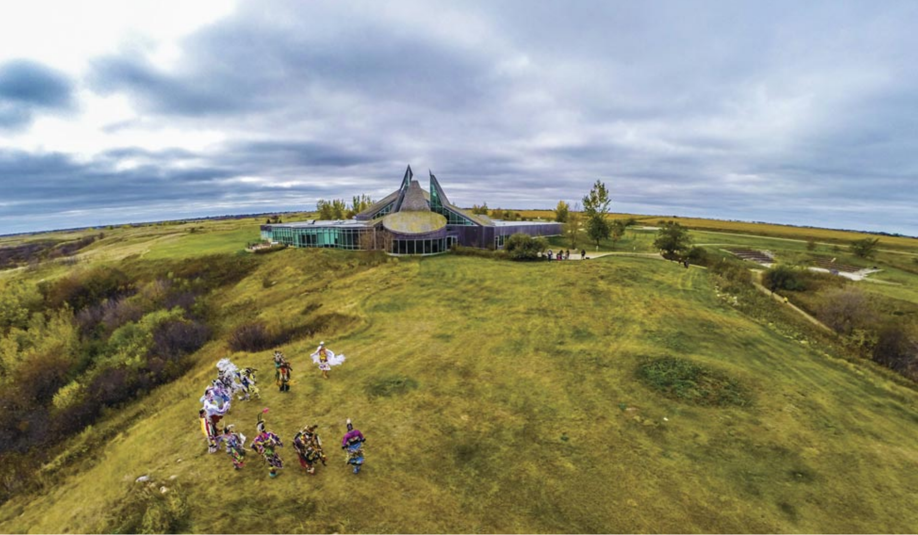
Wanuskewin Heritage Park.

It was a proud night for Saskatchewan when a Canadian Tourism Award was presented to Wanuskewin Heritage Park at a gala celebration on November 20 in Ottawa. Wanuskewin Heritage Park received the Indigenous Tourism Association of Canada (ITAC) Indigenous Tourism Award.