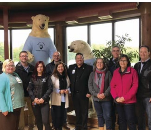
Bear Claw Hotel and Casino