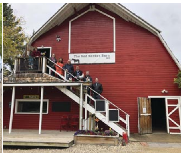
The Red Market Barn

Members of Tourism Saskatchewan's Board of Directors were treated to southeast hospitality during a visit to Moose Mountain Provincial Park and area in September. Between meetings and addressing board business, they became acquainted with local amenities and operators.