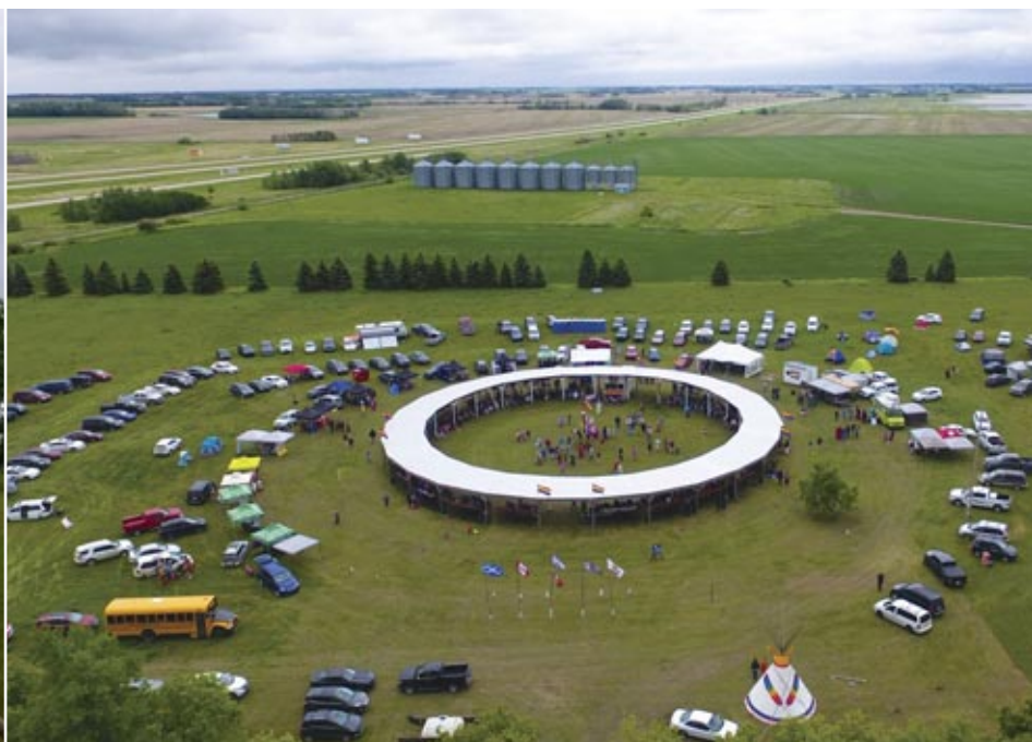
Two Spirit Powwow, Beardsley & Okemasis' Cree Nation.

Across Canada, Indigenous tourism generates $2.7 billion in gross economic output, $1.4 billion in GDP and more than $142 million in taxes.