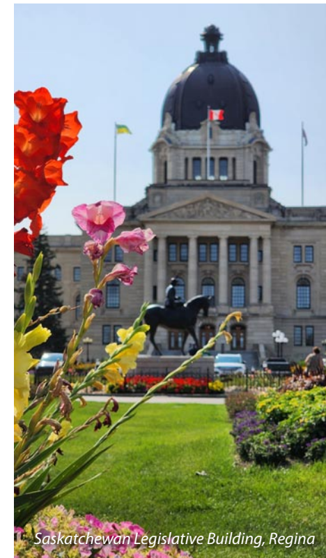
Saskatchewan Legislative Building, Regina

Moosomin is a major stop along the Trans-Canada to refuel, stock up on supplies, browse some interesting shops and sit down for a tasty meal. The town's character is reflected in the many well-preserved original buildings and homes. An outdoor medieval-form Chartres-replica labyrinth is a recent addition to the community. Self-guided heritage walking tours include 36 historically significant public buildings, homes, churches, businesses and structures. Moosomin & District Regional Park has pull-through RV sites.