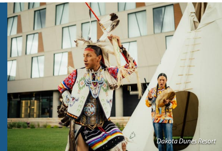
Dakota Dunes Resort

Visitor experiences available with Pêmisika Tourism, located on the lands of Beardy's & Okemasis' Cree Nation, include overnight