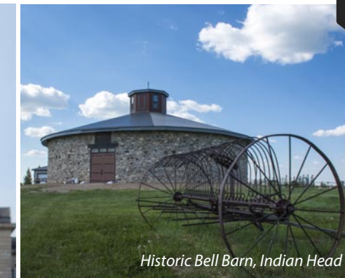
Historic Bell Barn, Indian Head