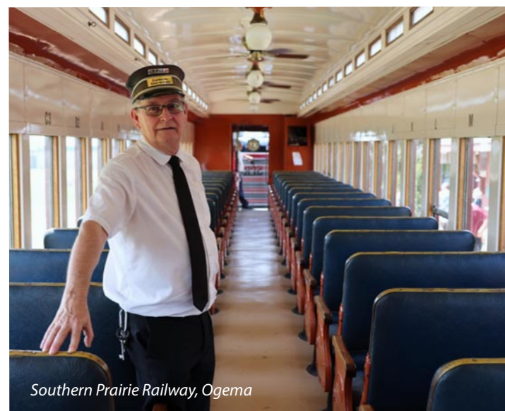
Southern Prairie Railway, Ogema

North of Carlyle on Highway 9, Moose Mountain Provincial Park is one of Saskatchewan's oldest parks. It is situated along Kenosee Lake and features beautiful stands of birch and poplar along the hilly topography. A heavily wooded area, uncommon for southern Saskatchewan, Moose Mountain is a sanctuary for birds and wildlife, and also home to rare plant species. An extensive trail system winds through the park. Camping is available from mid-May until late September.