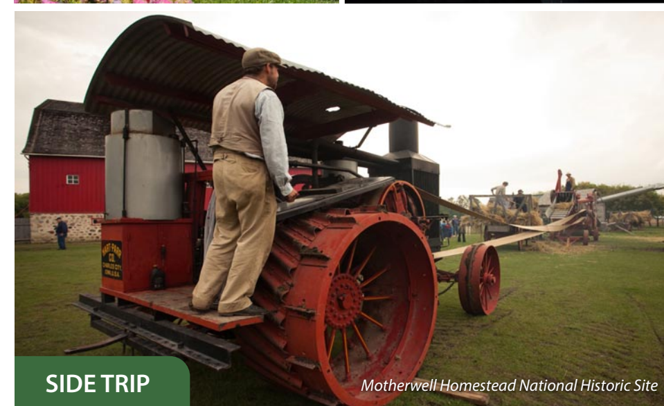
Motherwell Homestead National Historic Site