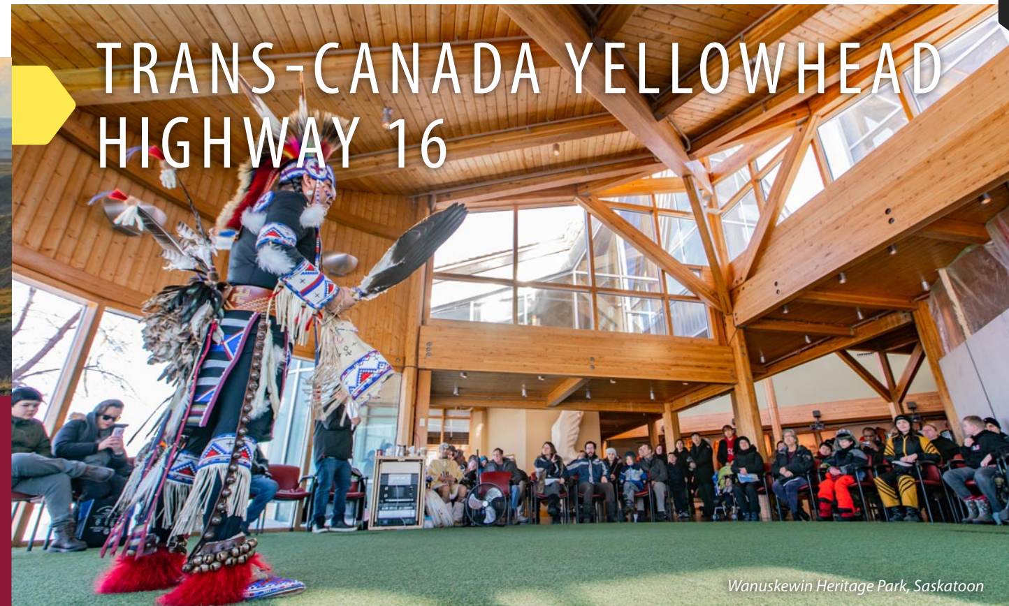
Wanuskewin Heritage Park, Saskatoon

Trans-Canada Yellowhead Highway 16 is the major route across central Saskatchewan. It navigates rolling parkland, passes through areas abundant with birds and wildlife, and crosses the North and South Saskatchewan Rivers. The highway connects to historic sites and communities where cultural traditions and storytelling create memorable visitor experiences. Yorkton, Saskatoon, North Battleford and Lloydminster are cities along the corridor.