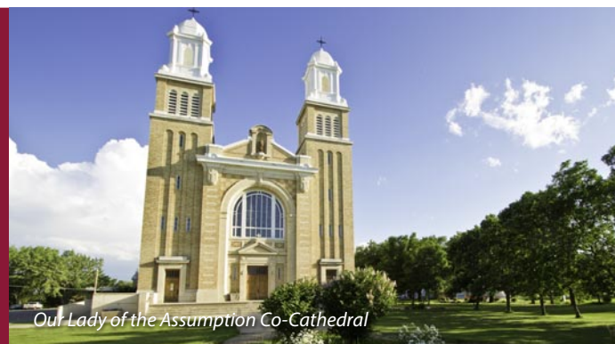
Our Lady of the Assumption Co-Cathedral

Follow Highway 2 to reach Old Wives Lake Nature Area near Mossbank. It is a designated Migratory Bird Sanctuary and part of the network of Western Hemisphere Shorebird Reserves. Old Wives Lake is the second largest saline lake in Canada and one of the best bird watching spots. In spring and fall, numerous