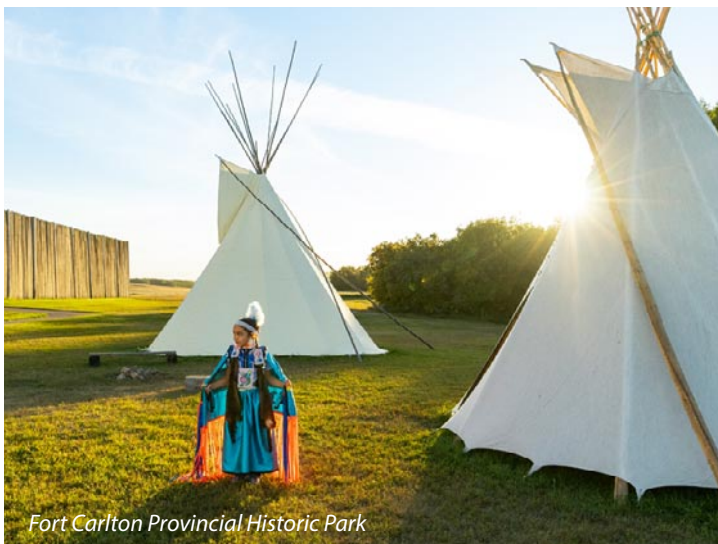
Fort Carlton Provincial Historic Park

Prince Albert is Saskatchewan's oldest city, and often called the Gateway to the North. It is situated along the North Saskatchewan River in an area where the picture-perfect agricultural landscape transitions to boreal forest. Recreational and leisure opportunities abound. The city is encircled by the 23-km Rotary Trail and has a 500-hectare forest park. Prince Albert has all the amenities that come with a progressive, mid-size urban centre. A treed campground within the city has full hook-up sites and is an ideal overnight stop for RV travellers. Take time to refresh, recharge and enjoy the local hospitality and cuisine before heading north on Highway 2 to Prince Albert National Park.