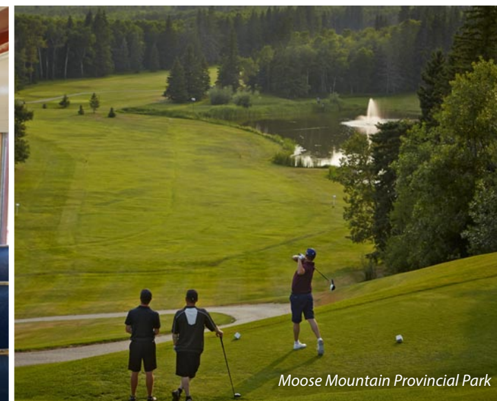
Moose Mountain Provincial Park