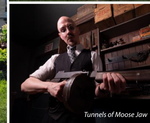
Tunnels of Moose Jaw