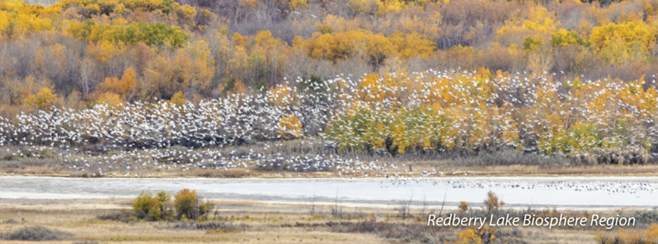
Redberry Lake Biosphere Region

Take Highway 40 for a scenic drive that leads to the Redberry Lake Biosphere Region, one of only 19 UNESCO biosphere regions in Canada. The environment includes a saline lake, fresh water lakes, natural prairies, ponds, marshes and aspen groves. It is a designated Important Bird Area and offers many birding opportunities along its winding trails.