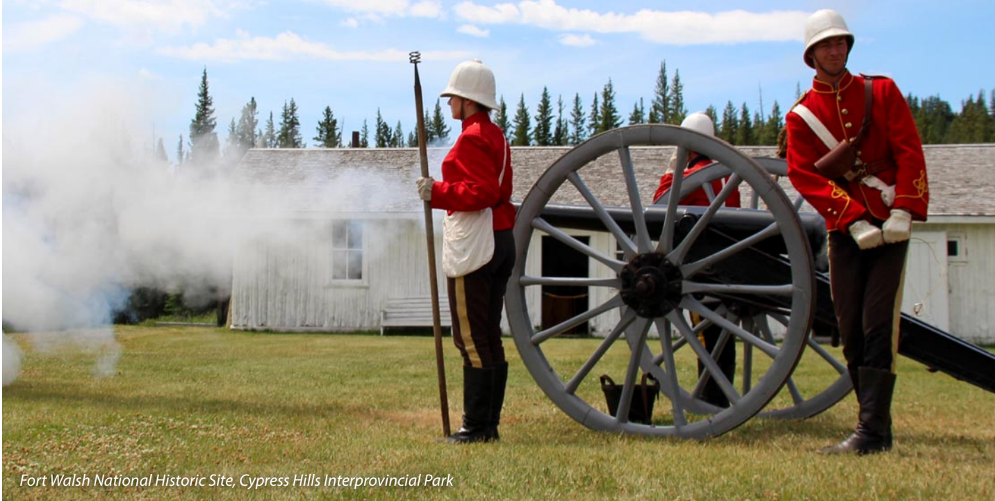
Fort Walsh National Historic Site, Cypress Hills Interprovincial Park

The Red Coat Trail approximates the journey taken by the North West Mounted Police (NWMP) on their March West in 1874. The highway stretches across southern Saskatchewan, passing through friendly communities and landscapes that echo stories and legends of the past. Side trips off the main route take visitors into the deep south, where the panorama shifts from forested areas to prairie grassland; from dinosaur country to haunting badlands. Consider circling off Highway 13 and discovering more about Saskatchewan – its history, diverse cultures, and places that surprise and captivate visitors.