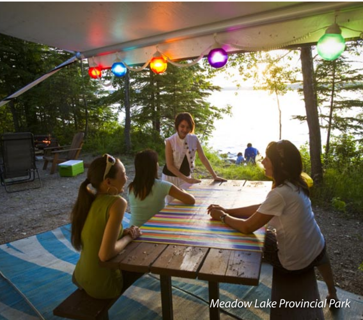
Meadow Lake Provincial Park

Meadow Lake Provincial Park has more than 20 lakes, rivers and streams within its boundaries. The epic 135-km Boreal Trail traverses wild and varied ecosystems within the northern forest. Greig Lake, Kimball Lake, Sandy Beach and Murray Doell campgrounds are recommended for RV travellers.