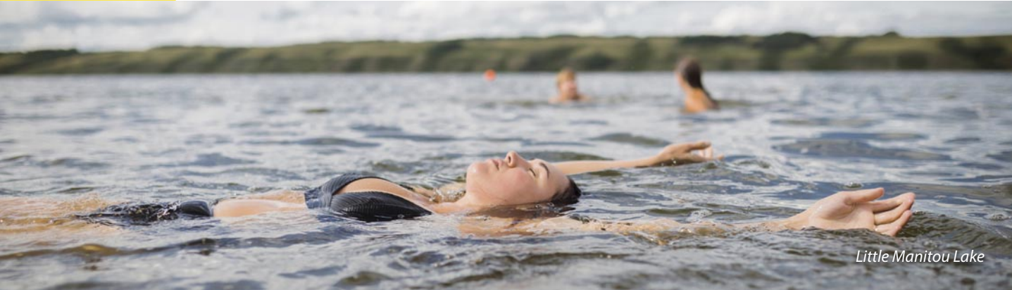
Little Manitou Lake

Venture south on Highway 2 to Watrous, then turn north on Highway 365 to get to Manitou Beach. The resort village reflects the spirit of a time when excursion trains brought vacationers to the area for relaxation and entertainment. Manitou Beach is along the shore of Little Manitou Lake, which has an intense mineral concentration and draws people from around the world for its reputed healing properties and remarkable buoyancy – it is impossible to sink in this water.