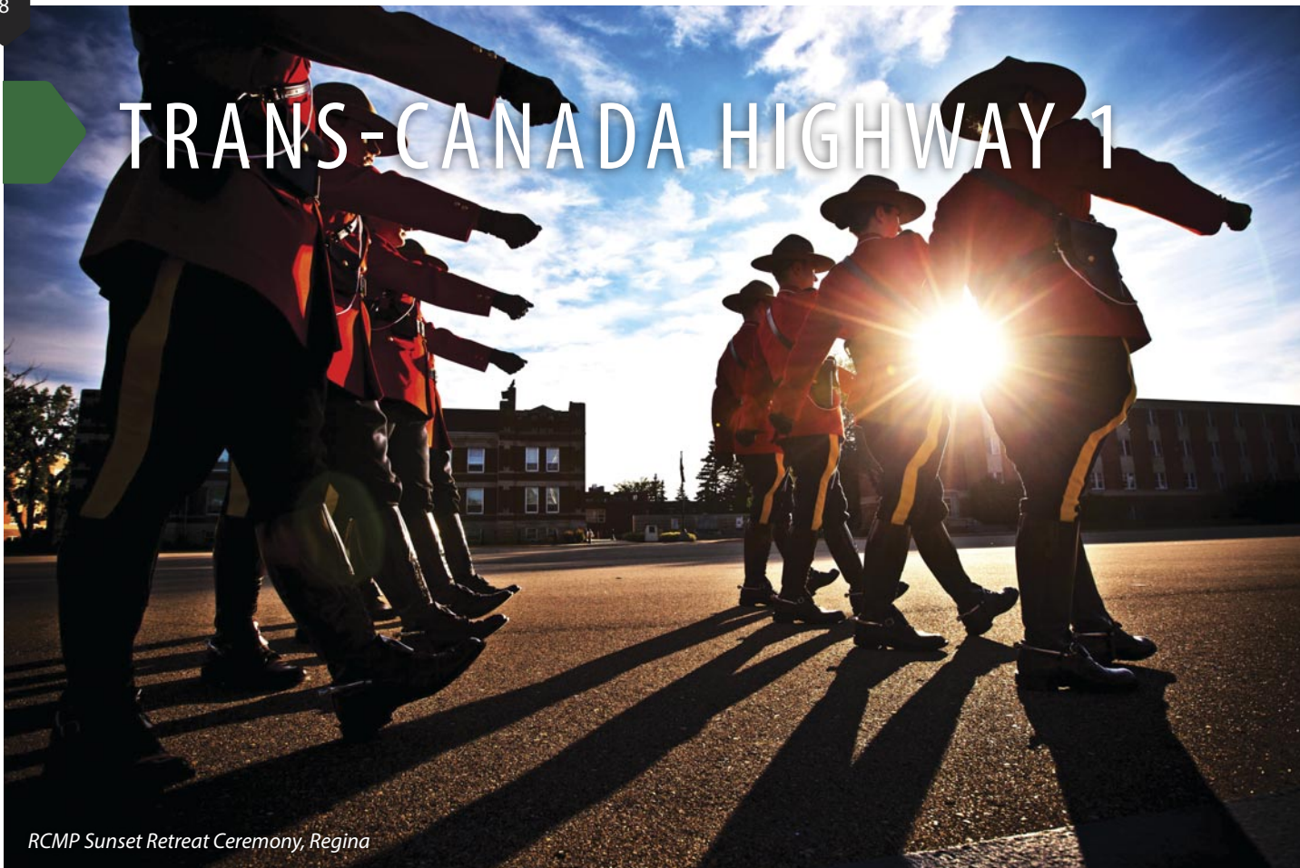
RCMP Sunset Retreat Ceremony, Regina

Trans-Canada Highway 1 is the main southern route across Saskatchewan. The four-lane divided highway passes through major urban centres – Regina, Moose Jaw and Swift Current – as well as many welcoming towns and villages. In the summer, the patchwork of colourful crops in bloom is picture-worthy. The Qu'Appelle Valley, just a few miles north of the Trans-Canada, stretches halfway across the province. Its rolling terrain, tranquil lakes and meandering waterways provide a dramatic contrast to the smooth plains.