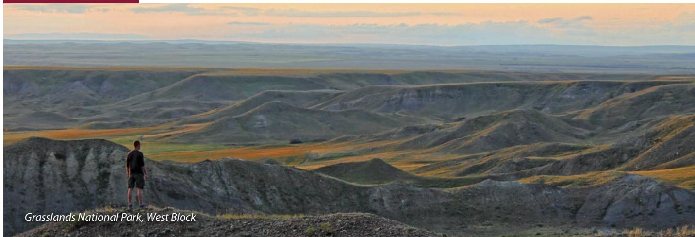
Grasslands National Park, West Block

Grasslands National Park is in two sections. Travelling south on Highway 4 will take you to the West Block entrance. Take the Ecotour Scenic Drive and view Plains bison as they roam the land, grazing on native grasses. Black-tailed prairie dogs and pronghorns are just some of the species that inhabit the area. More than 12,000 tipi rings dot the landscape.