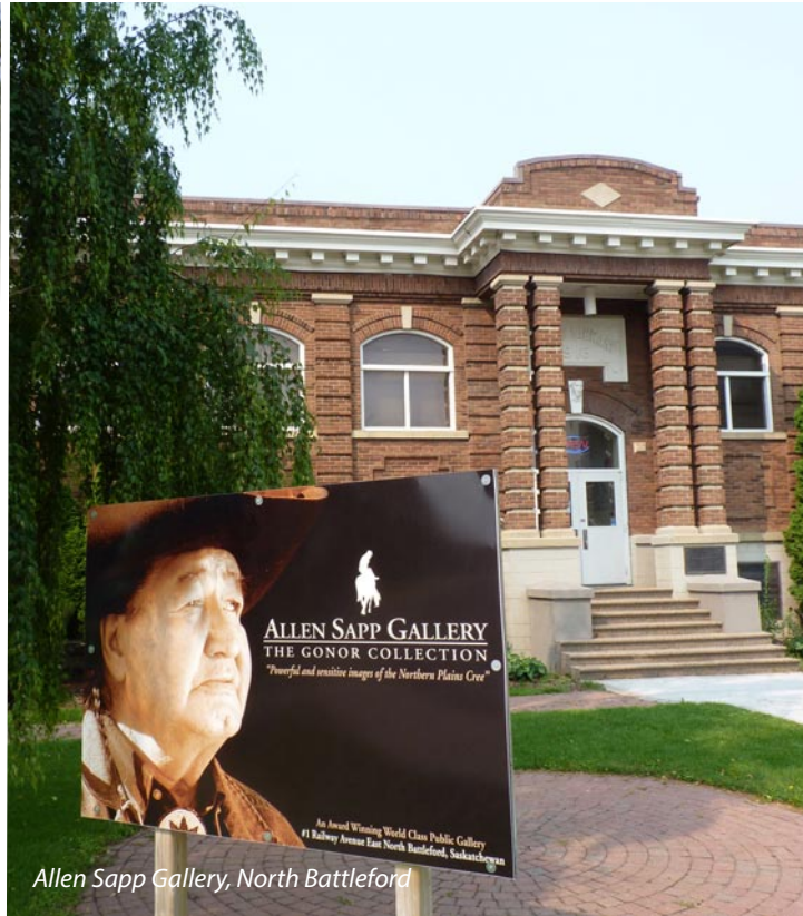
Allen Sapp Gallery, North Battleford

The Yorkton Visitor Information Centre caters to RV travellers and offers sewage disposal and potable water. Both the city campground and nearby York Lake Regional Park have pull-through RV sites and dumping stations.