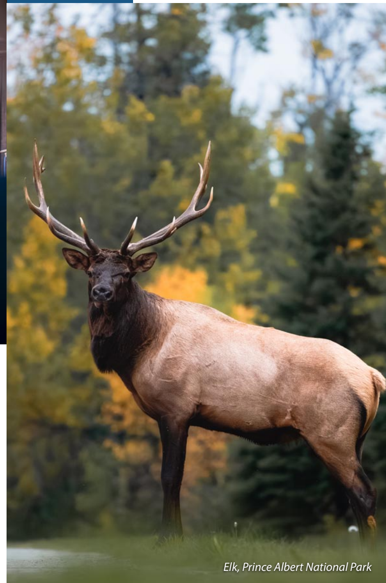
Elk, Prince Albert National Park

Open year round, Prince Albert National Park protects 3,875 sq. km of boreal forest and an abundance of lakes, rivers and wetlands. It is a sanctuary for wildlife, birds and rare flora and fauna. Sightings of moose and elk are common, and the park is home to a protected pelican nesting colony, as well as healthy loon populations. In summer and shoulder seasons, the park maintains an extensive network of hiking trails that wind along the lakes and through the forest. Two marinas offer boat, canoe and kayak rentals. The cabin of famed conservationist Grey Owl is on the shore of Ajawaan Lake, and accessible by canoe or kayak. On foot, it is a 20-km hike (one way).