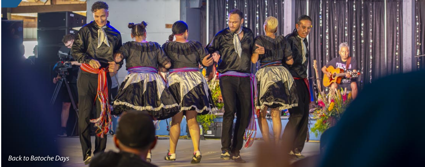
Back to Batoche Days

The Louis Riel Trail is a 391-km route from Regina to Saskatoon to Prince Albert. The highway is named in honour of Louis Riel, who led Métis and allied First Nations in defense of their land during the 1885 Northwest Resistance. Riel was captured by government forces and brought to Regina, where he stood trial and was executed for treason. Sites along the Louis Riel Trail mark episodes in the resistance and highlight stories of Métis and First Nations peoples.