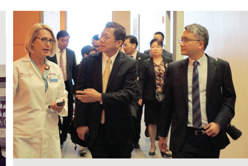
2018 Global Health Executive Training

UChicago Medicine offers a unique experience to learn the best practices of hospital management and operations throughout lectures, discussions and onsite shadowing. The training agenda will be customized based on your specific needs and varies in duration, taking 1 to 4 weeks to complete.