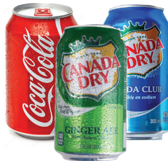
Coke, Ginger Ale, and Club Soda