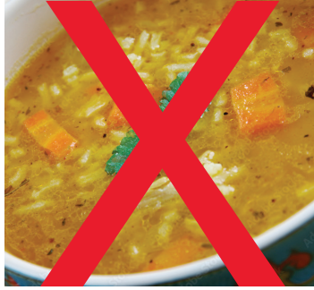
No Soup (with vegetables, noodles, rice, meat or other chunks of food)