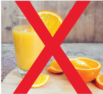
No orange juice