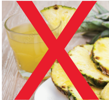
No pineapple juice