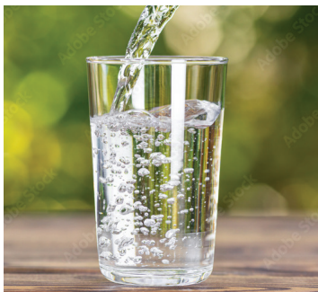
Water and Mineral Water