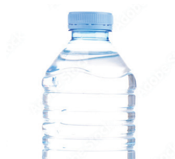
Clear Sports Drink (Propel Fitness Water or Clear Gatorade)