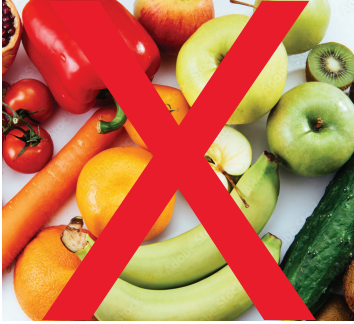
No fruits or vegetables