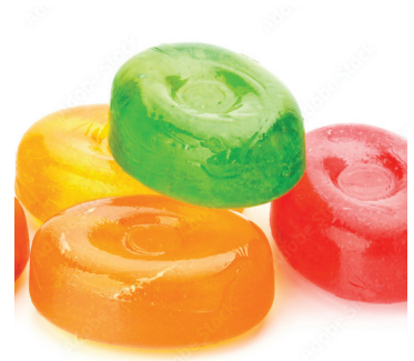
Clear Hard Candy