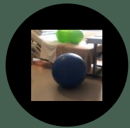
LABOR AND DELIVERY