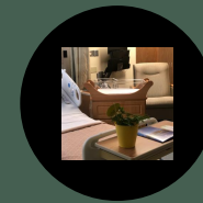
BREASTFEEDING EDUCATION AND SUPPORT