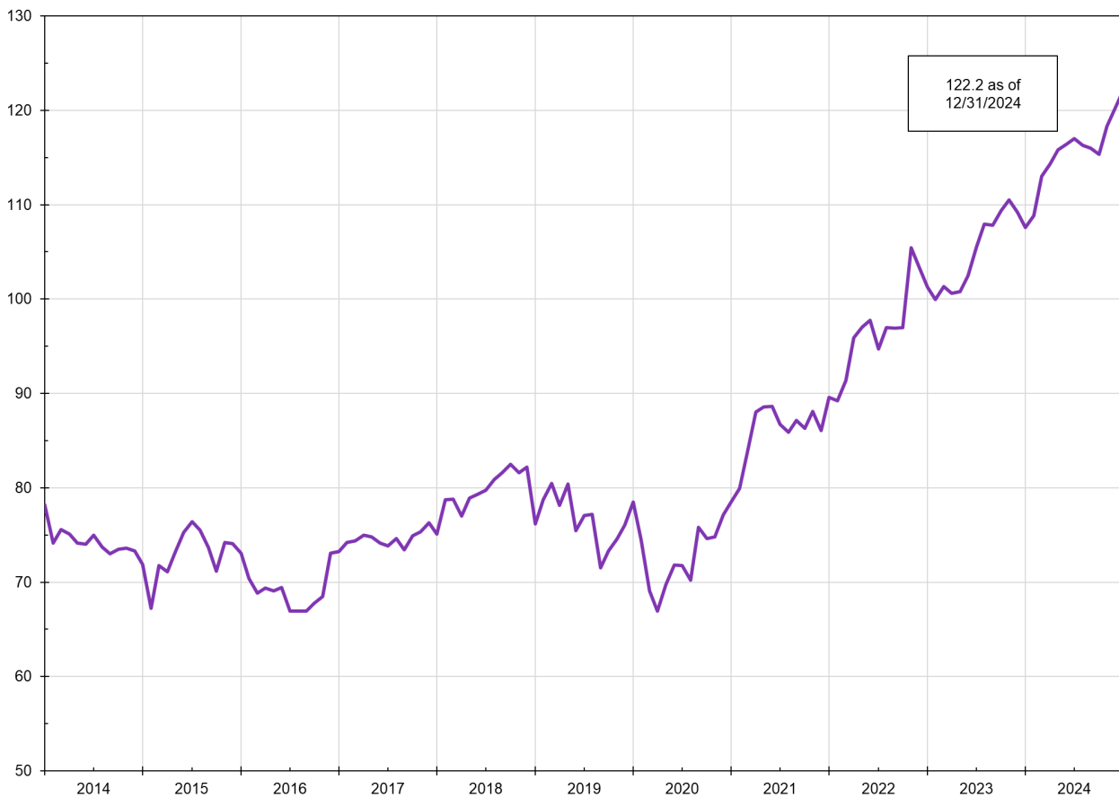
WTW Pension Index

The WTW Pension Index has continued its rise to the highest value since mid-2000 for December 2024. Negative investment returns were more than offset by decreases in liabilities due to increases in discount rates, resulting in a December 31, 2024 index level of 122.2, an increase of 1.5% over the prior month.