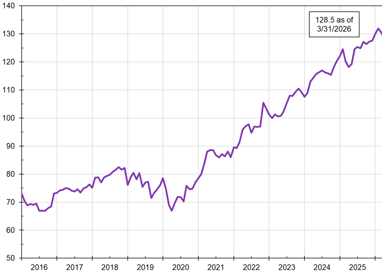
WTW Pension Index

The WTW Pension Index has continued to decrease in March 2026. The decrease in liabilities was outweighed by the negative investment returns in the benchmark portfolio, resulting in a March 2026 index level of 128.5, a decrease of 1.6% from the prior month.