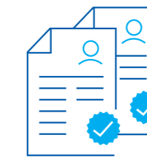
Workers' Injury Risks