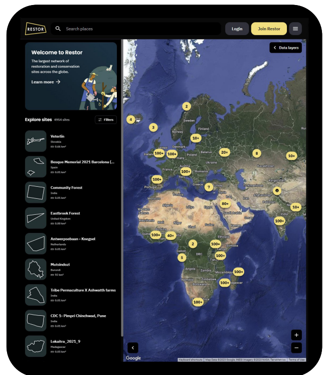
Preview of the Restor platform with all the restoration sites around the globe

Join the community today to see how restoration professionals are working to restore nature in your area, and search and find the most impactful projects to support!