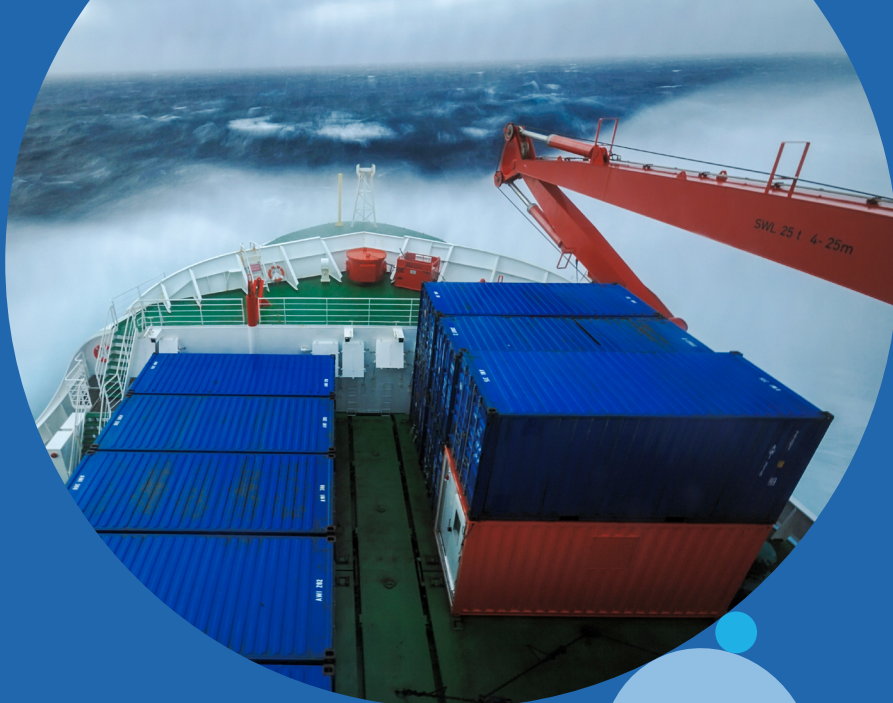
Chart a smoother course with Zurich Marine Insurance

Zurich's Marine Insurance specialists navigate the risk management needs of diverse industries involved in manufacturing and international trade. Our seasoned crew, with an average of 20 years of experience, possesses deep understanding of shifting market currents, offering flexible, customized products and services to tackle even the most unique challenges.