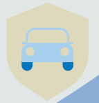
Table of benefits

If you can provide the evidence of conviction against the third party driver(s) obtained from a court, and there is no prosecution against you and you have not received any writ or summons relating to the accident when the claim arises, the claim made shall not result in cancellation or reduction of the CFD.