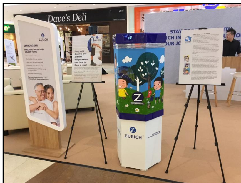
Giant Coin Jar at ZIMB’s Journey to Wellness Roadshow in IOI City Mall, Putrajaya

The giant coin jar will be travelling to selected locations nationwide with the first pit stop at Putrajaya’s IOI City Mall from 15 th July to 17 th July; and will head up north to Sungai Petani and Penang thereafter. Proceeds collected at these roadshows will be channelled to the Shelter Home for Children to help provide food, clothing and education for the children as well as maintenance of the home.